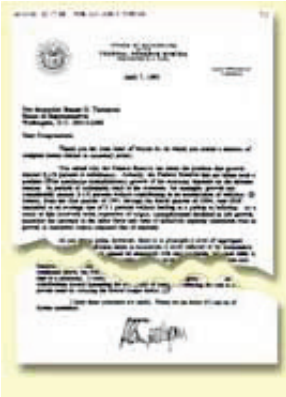
Letter from Alan Greenspan, Chairman of the Board of Governors of the Federal Reserve System , to U.S. Congressman Bennie G. Thompson (D-MS). Reprinted with permission.